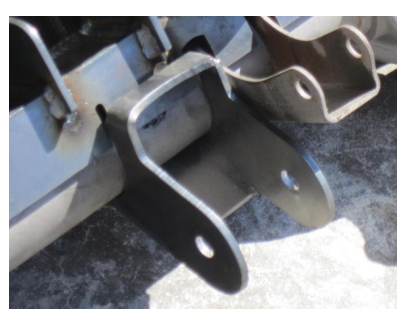
Fig. 3 – passenger side view from behind axle

To locate HD LCA mount on the axle line up the mount with notches that are precut into the truss (see Figure 2). Rotate mount upwards until mount sits against the truss, tack in place. Repeat step for opposite side. Once satisfied with location of lower control arm mounts, weld them into place.