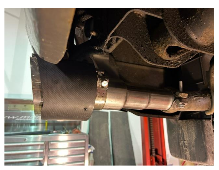
Congratulations! You are ready to begin experiencing the improved appearance of your MBRP Exhaust Tips. We know you will enjoy your purchase!

3. Verify that all hardware is tight, and the Exhaust Tips are fully secure with even clearance from the bumper opening.