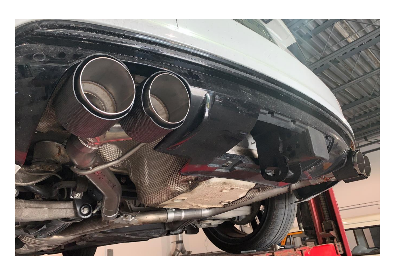
Congratulations! You are ready to begin experiencing the improved power, sound and driving experience of your MBRP performance exhaust system. We know you will enjoy your purchase.

4. Align the edge of each band clamp with the edge of the joint it is connecting. Tighten all hardware and clamps, starting at the front and working rearward to secure the system. Check along the full length of the exhaust system to ensure there is adequate clearance for fuel lines, vent lines, brake lines, frame, bodywork, suspension, and any wiring, etc. If there is any interference detected, relocate, or adjust to provide adequate clearance. Ensure all clamp connections are secure and components are unable to rotate or slide. Band clamps require approximately 45 lb-ft (60 N-m) of torque. Verify clearances, system security and band clamp torque after 30- 60 miles (50-100 km) of driving.