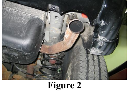
3. Remove the tail section of the exhaust by removing it from the rubber isolators. Refer to Figure 2.