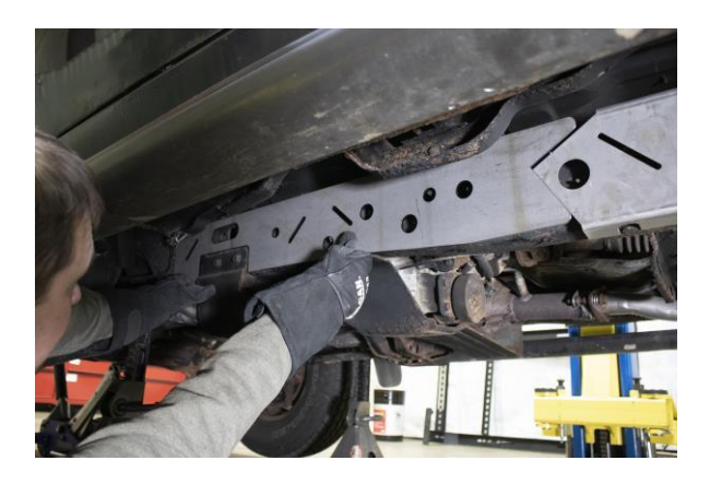
100% weld around all edges.

Use a jack stand or C-clamps to hold the part into place and, while following proper welding procedures, weld the part to the frame.