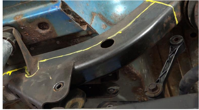
Depending on how you intend to cut, clean the cut zones free of rust and down to bare metal.

Mark down 1.5 inches from the top of the frame rail, on the inside and outside. You will need to cut off the frame side upper control arm mount on the inside of the frame rail.