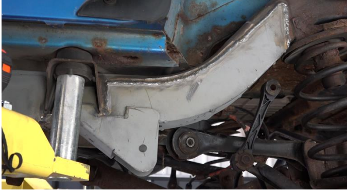
100% weld around all edges.