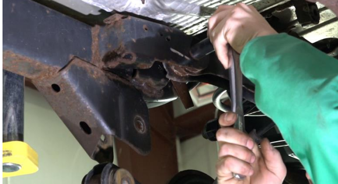
Rotate control arms down and out of the way. This may require you to loosen the axle side bolts.

Remove upper control arm bolt using 15mm socket.