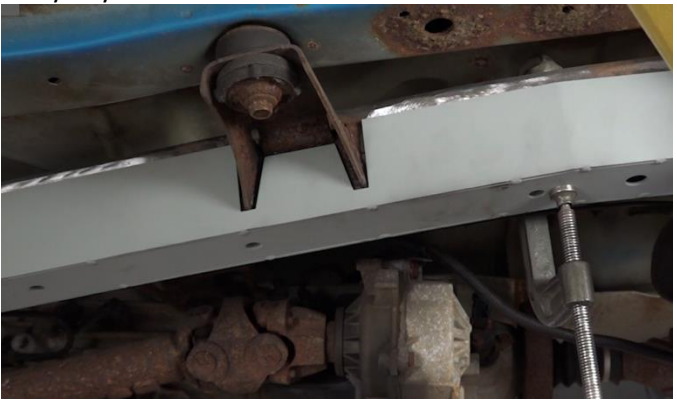
The part may fit snugly and require force.

Attempt to push the part into place and over the frame rails. Take note of any difficulties and cut away any obstructions.