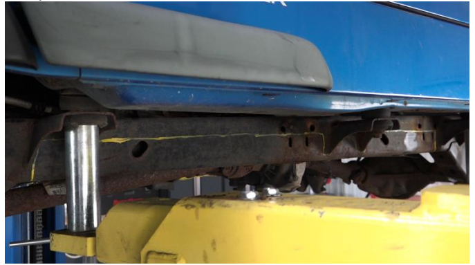
Depending on how you intend to cut, clean the cut zones free of rust and down to bare metal.

Mark down 1.5 inches from the top of the frame rail. on the inside and outside. You will do this from the front most body mount bracket to the rear most body mount bracket.