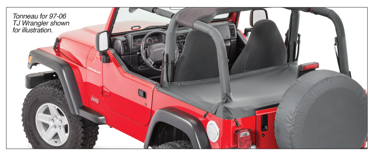
Parts List: Fabric Tonneau Cargo Cover - QTY 1

Items #14502115, #145031XX, #145042XX and #14505235