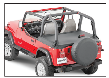
Tonneau Cover: For 92-95 (Later YJ)