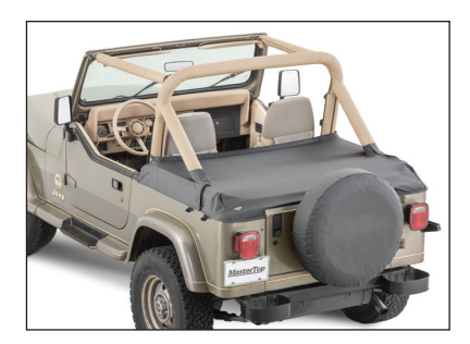
Tonneau Cover: for 87-91 (Early YJ)