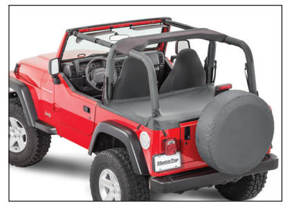
Tonneau Cover: For 97-06 (TJ)