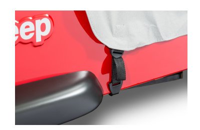
Parts List: Fabric Full Door Cab Cover, Qty 1