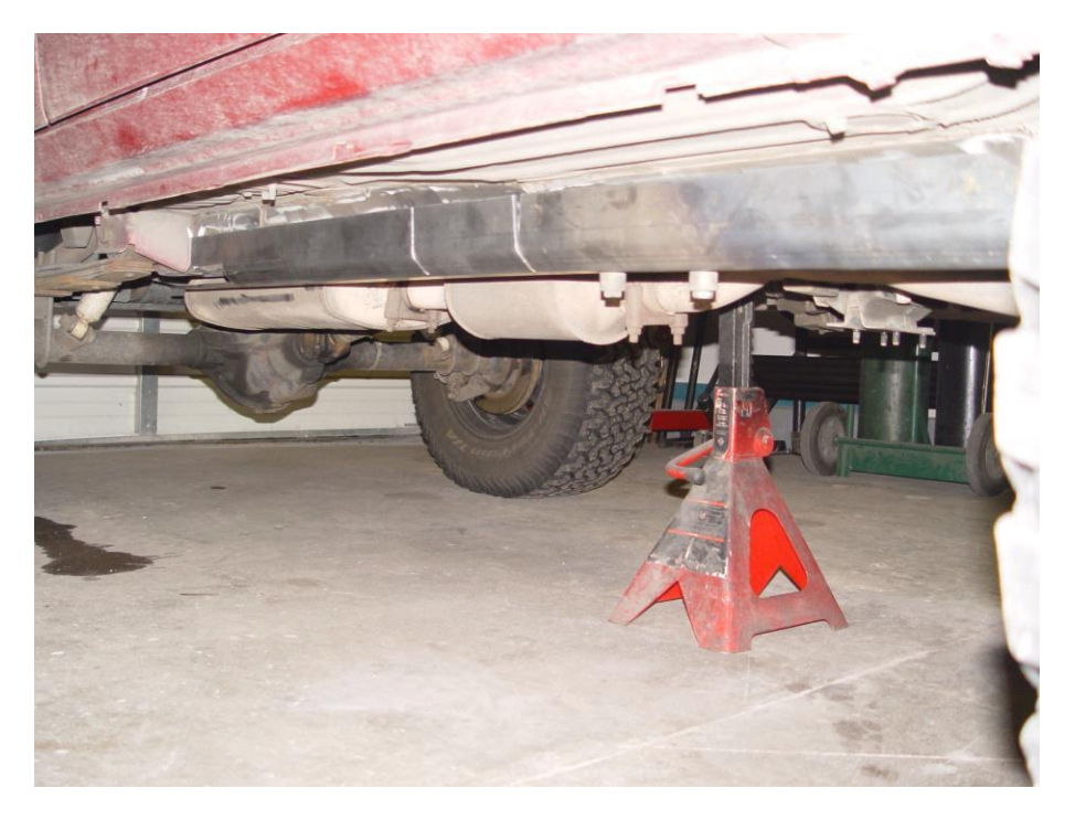
STEP 4 Using a floor jack and a block of wood, place the jack as shown in the picture below:

When properly installed the rear most tab on the vertical leg of the Stiffner should bottom out against the rear spring hanger as shown below.