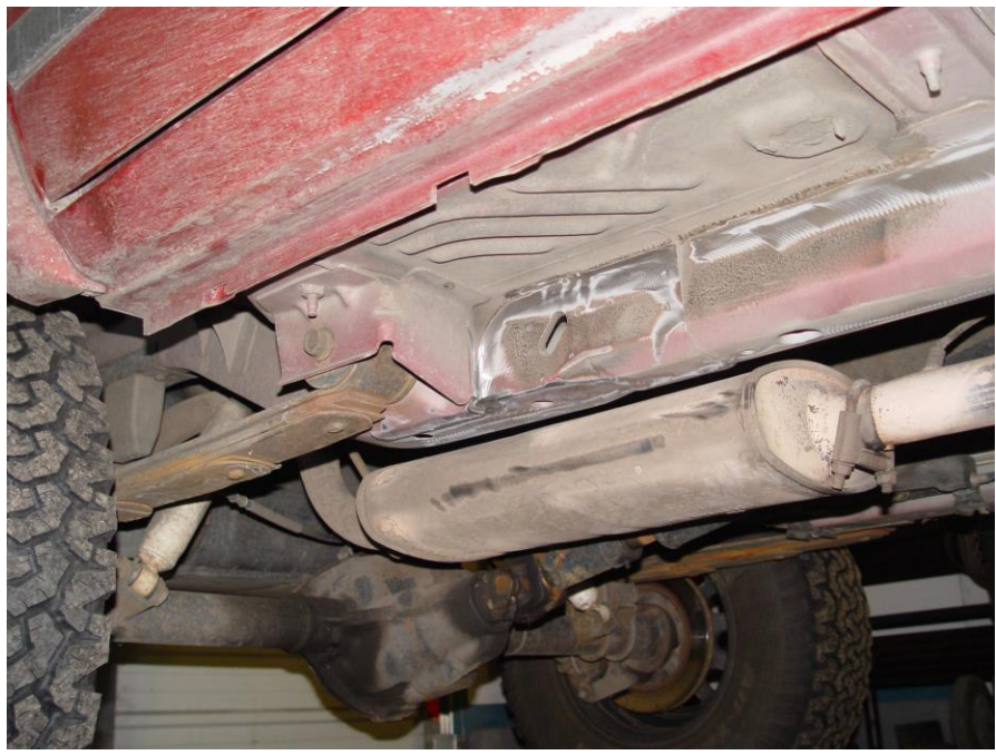
Rear uni-rail section

After the Uni-rail section has been prepped place the Stiffner Z^{TM} to be installed up to the body and ensure that all edges around the Stiffner Z^{TM} are clean and prepped for welding, grind as needed.