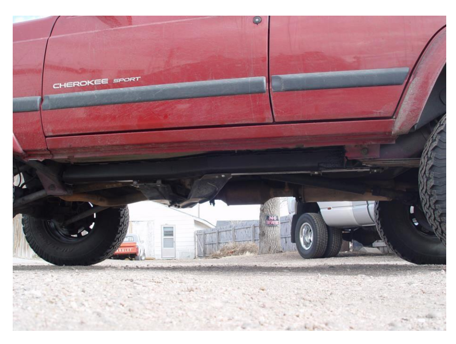
Jeep, XJ & MJ are registered trademarks of the Daimler Chrysler Corp. and are use for reference only.

When the StiffnerZ<sup>TM</sup> are in position begin stitch welding them onto the body. Take necessary precautions associated with welding on a vehicle. TNT recommends that welding be done by a qualified welder. Once the StiffnerZ<sup>TM</sup> are welded into position paint or undercoat them as desired. Reinstall all transmission mounting parts removed earlier and enjoy a noticeable improvement to your chassis.