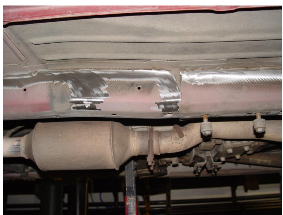
Center Uni-rail section