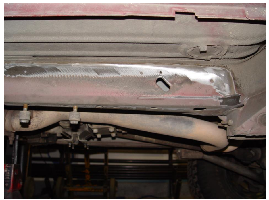
Forward Uni-rail section

Begin by removing the paint and or undercoating applied to the Uni-body as shown in the following pictures. For best results the Uni-rails should be ground to bare metal.