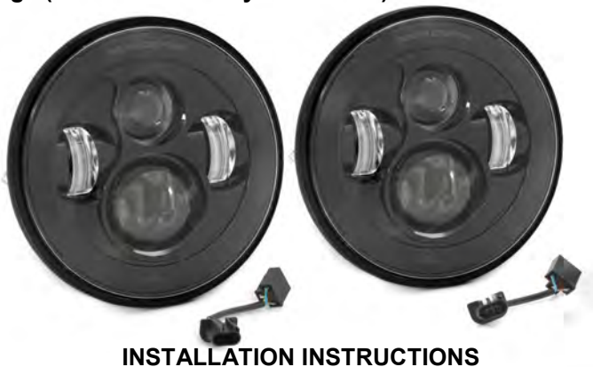
07-18 JEEP JK

Tools Needed: T-15 Torx Head Bit Pry Tool