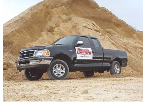
POST INSTALLATION INSTRUCTIONS