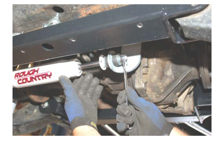
Place washer on bolt behind stabilizer bracket here