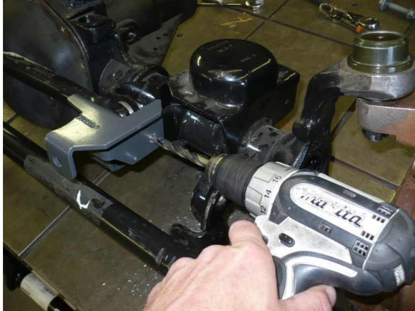
Figure 2. Drilling Side Hole for Stabilizer Bracket