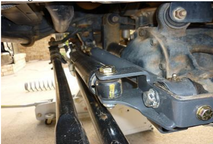
Figure 3. Bracket Installed With Stabilizer