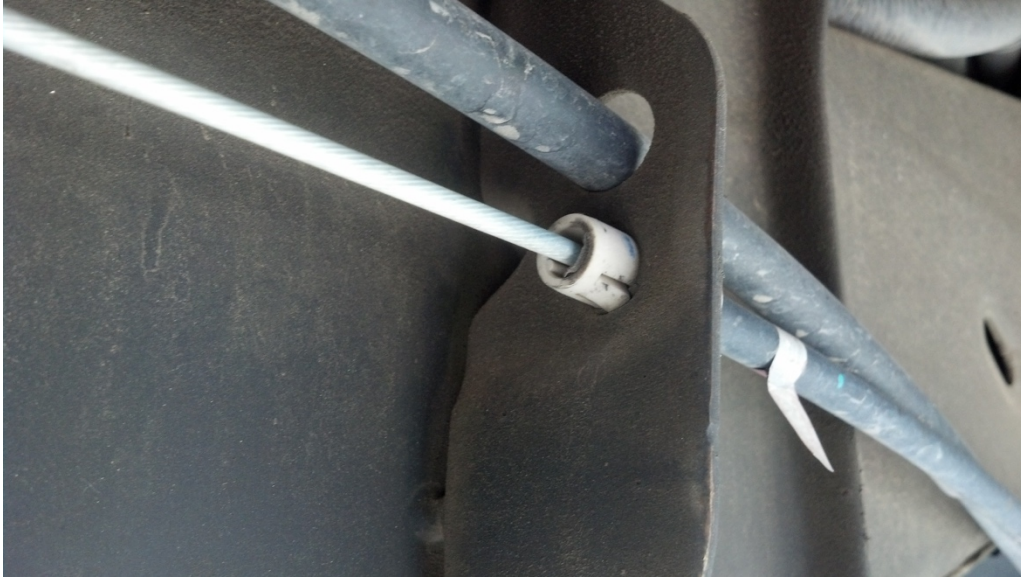
Figure 2: squeeze the plastic tabs in to remove the cable end cap from the frame.