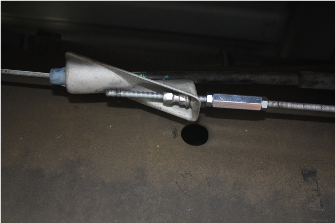
Figure 4: Completed installation. Adjust accordingly.