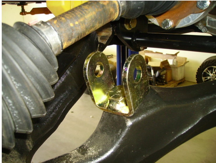
Figure 1: Clevis in lower a-arm, don't tighten yet.