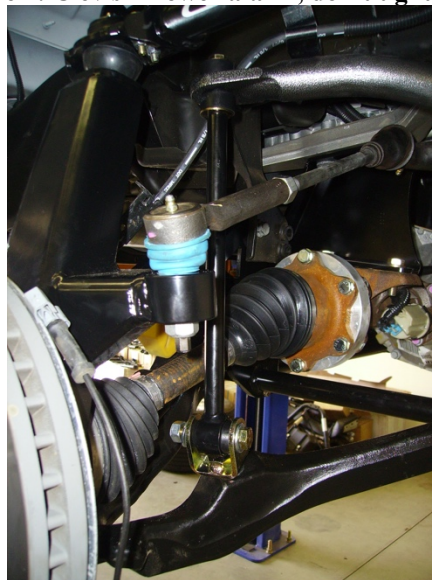
Figure 2: end link in place, clevis rotated so bushing relaxed, now tighten.