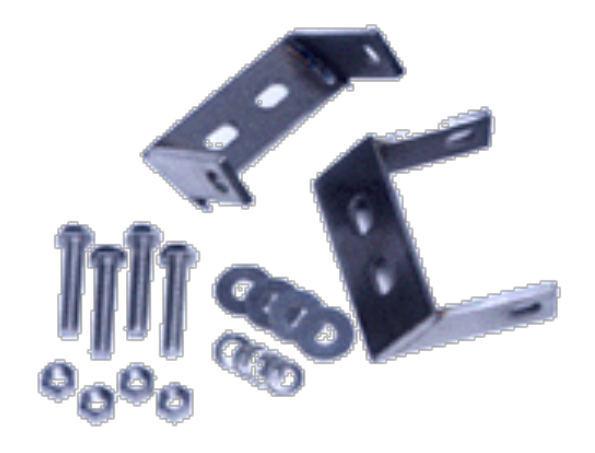
Rear Cross Member 29 7/8"

Place rear bumper brackets as shown on the rear cross member and fasten using 3/8" stainless bolts. Place the bumper on the bumper brackets and fasten bumper to brackets.